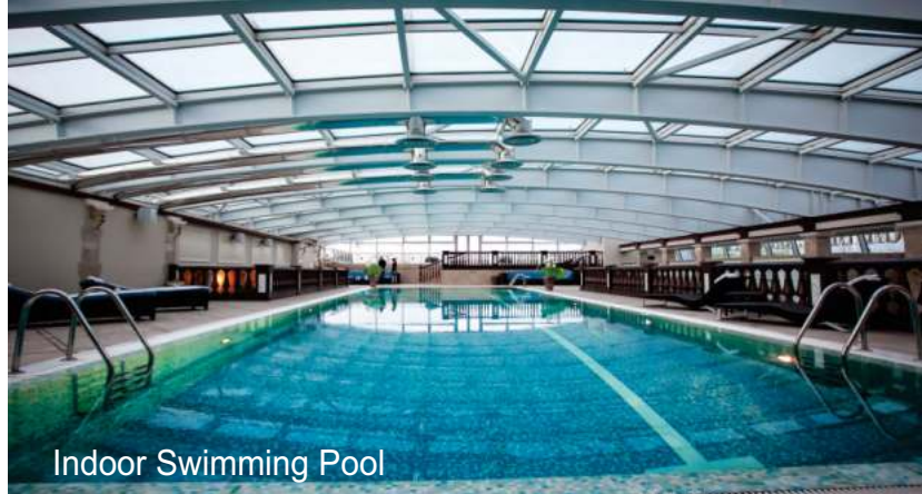
Indoor Swimming Pool