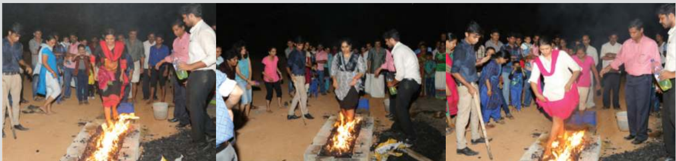
Fire walking exercise for confidence building performed by teachers during a corporate level workshop