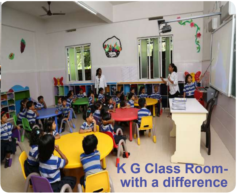
K G Class Room- with a difference