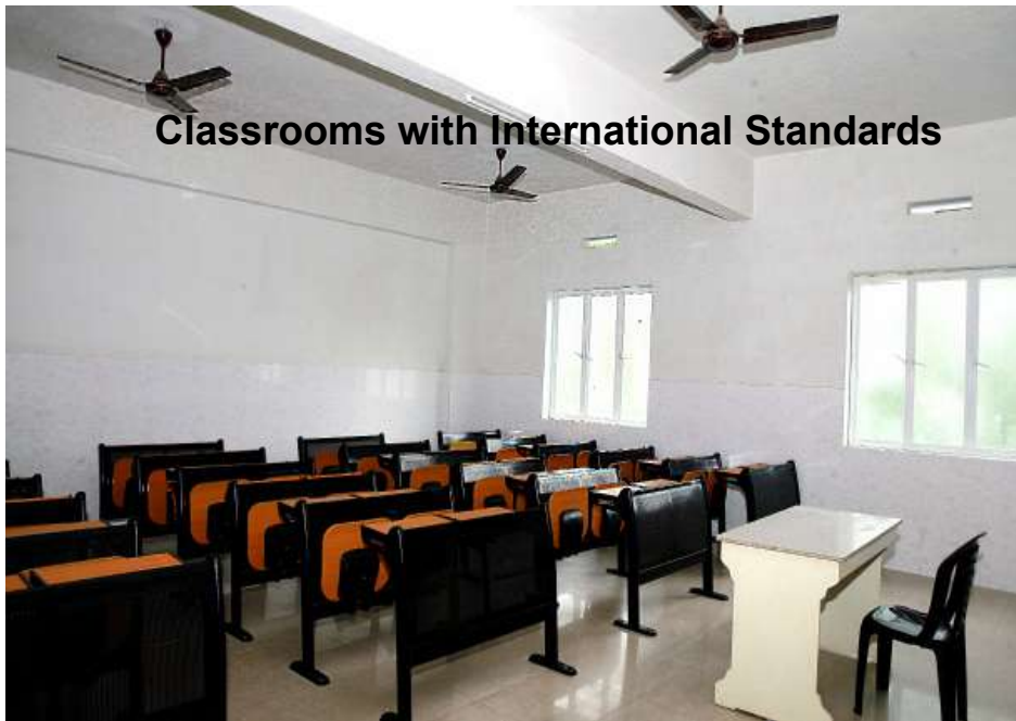
Classrooms with International Standards