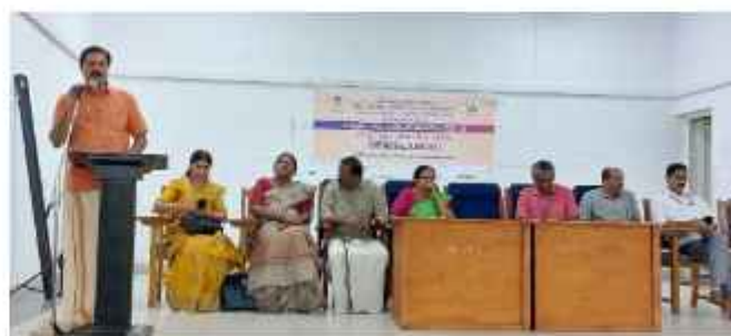
Preparation of Position Papers of Language Education