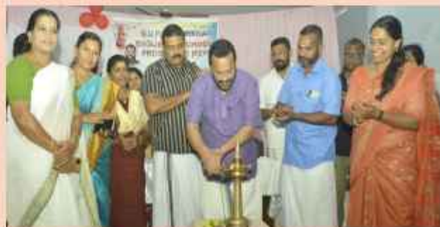
Sri. K.Rajan, Minister for Revenue and Housing inaugurates the ELEP Programme at GUPS Asarikkad, Thrissur

The school level inauguration of the EEP was held on 07/01/2023 at the selected schools of Thrissur district.