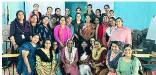
Phase 1 Training – Pedagogic Content Knowledge (PCK)